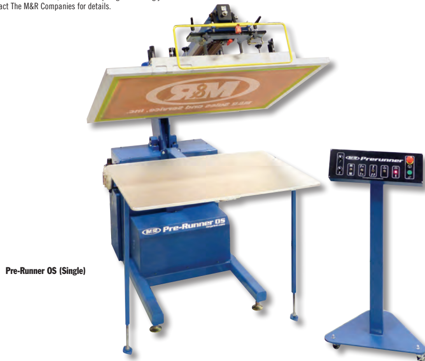
Pre-Runner OS (Single)

1 If incoming voltage differs from the voltage(s) listed in this brochure, calculate amperage accordingly. Other electrical configurations are available: Contact The M&R Companies for details.