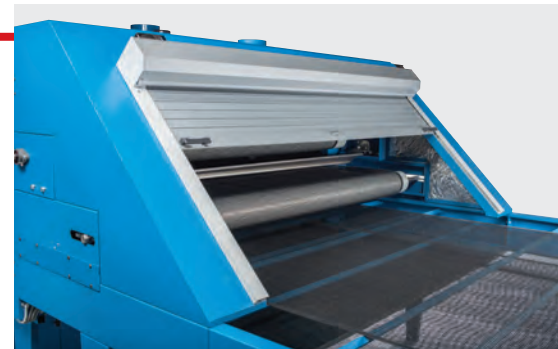
INTEGRATED ROLL-DOWN OUTFEED HOOD