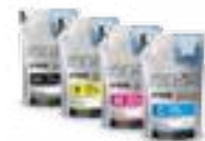
High capacity 1L original ink packs.