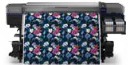
SC-F9330 Up to 64" Wide

The Epson SureColor™ SC-F9330 is Epson's next generation textile dye-sublimation transfer printer. Designed specifically for the purpose of dye-sublimation printing, it combines the speed, precision and durability of PrecisionCore™ printhead technology with an original dual 1.5L InkTank system to deliver amazing performance for highly efficient and reliable production runs. With printing speeds of up to 108.6m 2 /h* and a new high-density black ink to reduce ink consumption, the SC-F9330 is your ideal partner for high-volume commercial applications that will set you apart with its impressive print quality and low running costs.